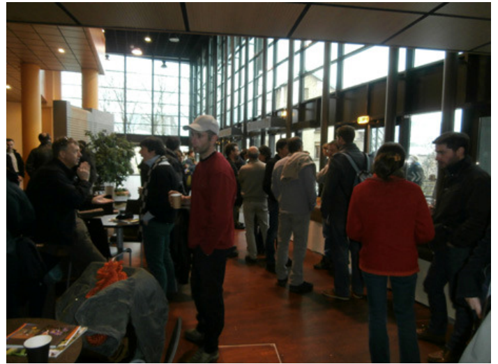
Just arriving from Paris a little café at the palais des congrès