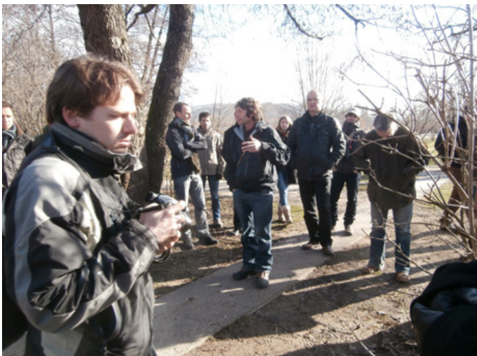
Sunny day in winter...