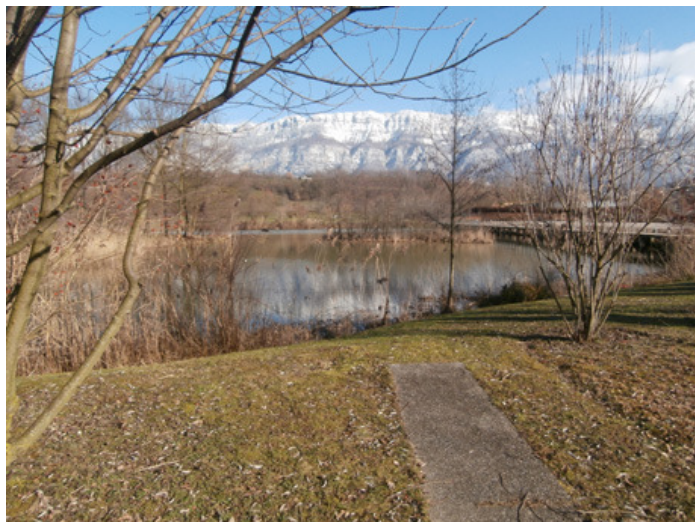
Wetland and mountains