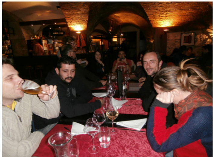
Then in Restaurant