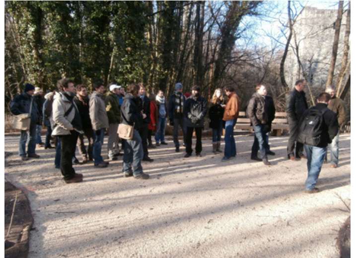
The group of visitors