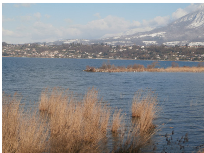
Near human habitat