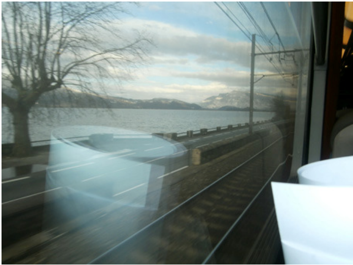
The Bourget Lake and my poster by train