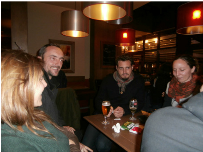
Corsica delegation in a pub at night