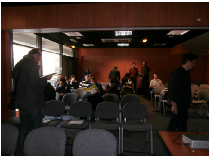
The JT's conference room