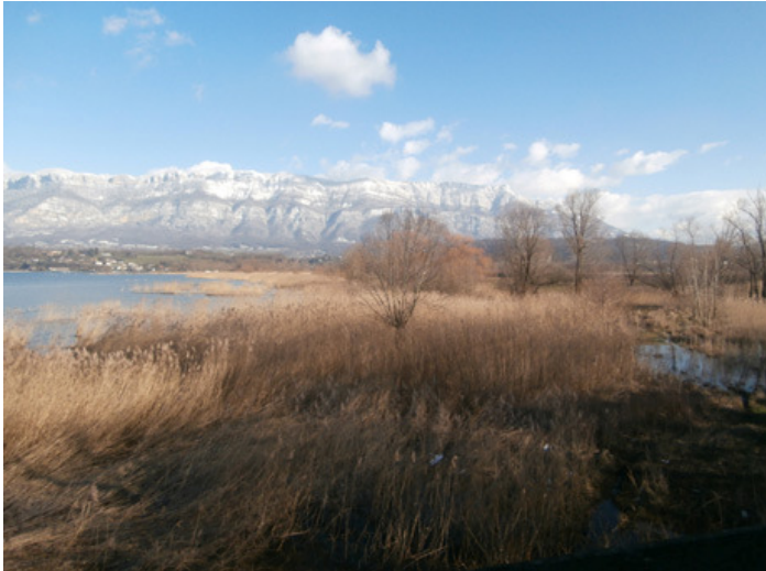
Where emys live