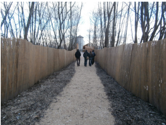
The second observation post