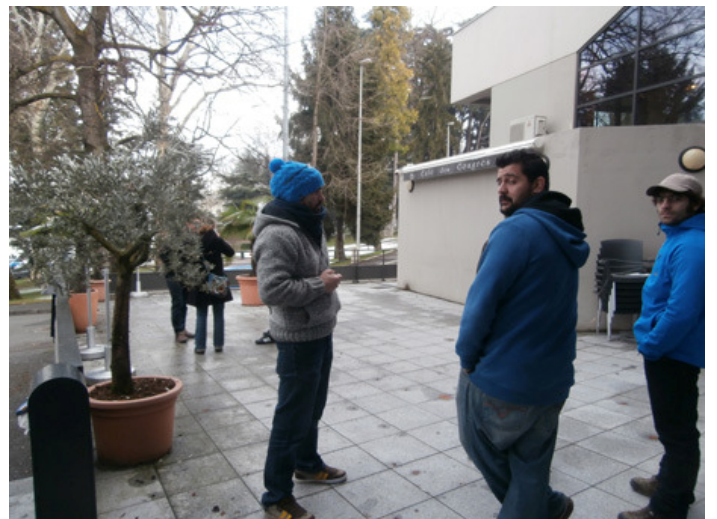
The difficult waking up after a long travel