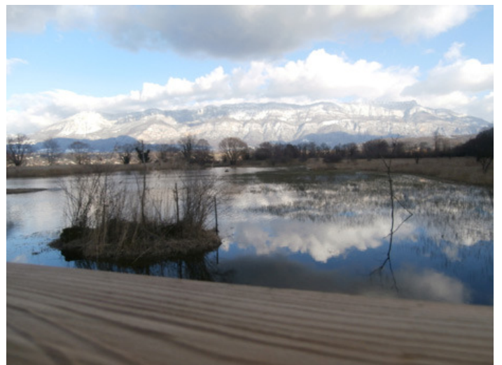
Very nice natural area