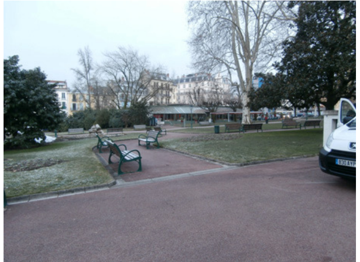
Lunch in the restaurant of this park near the palais des congrès