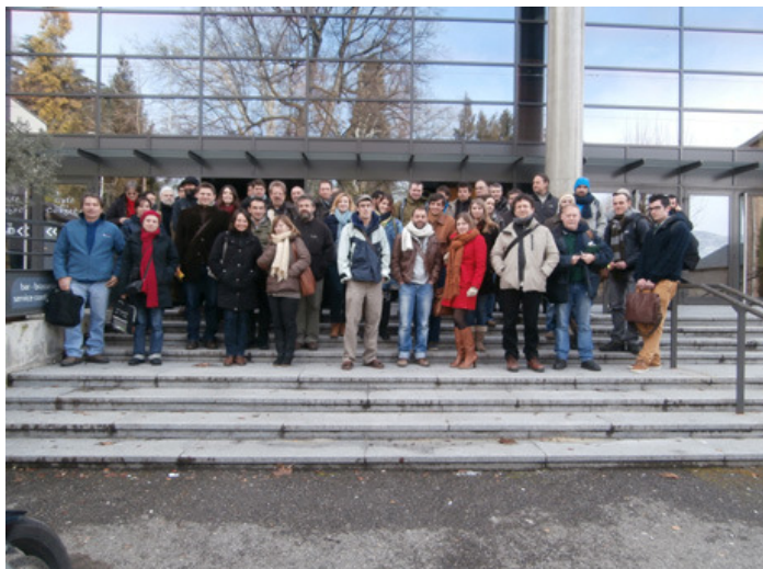
The JT's participants