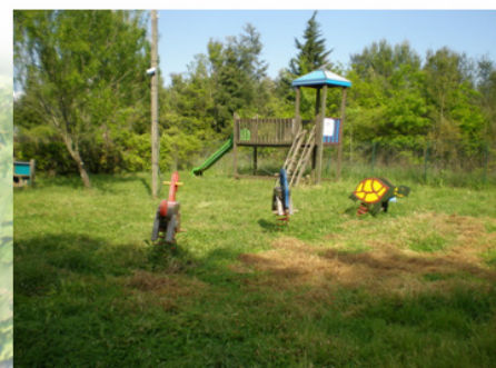
Installations pour les enfants, à démonter...