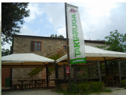
Ruine entièrement réhabilitée par les volontaires de Carapax. Objet de la contestation d'origine.

Editor in Chief Acta Herpetologica ( http://ejour-fup.unifi.it/index.php/ah )