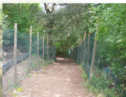
Des kilomètres de grillage à enlever...