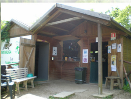
Chalet à l'entrée du centre, à démonter...