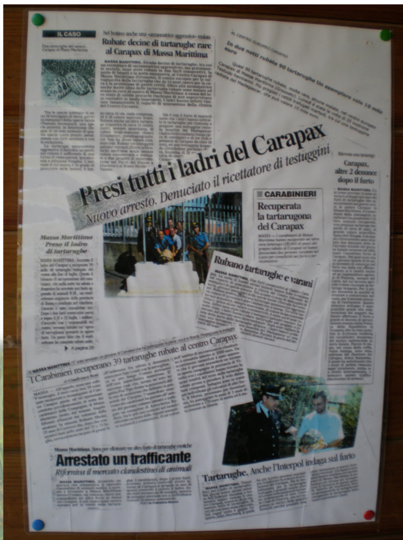
Coupages de presse sur les saisies anti-traffic.